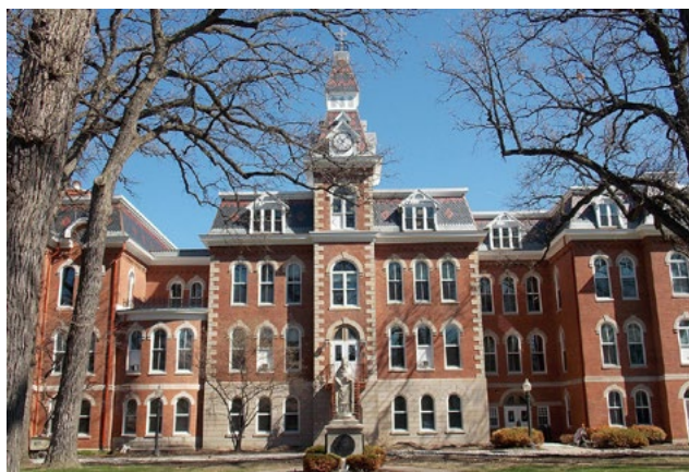
St Ambrose in Davenport